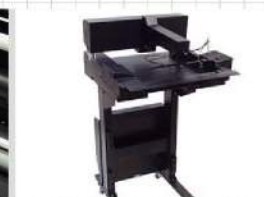
Auto Sheet Feeder (Optional)